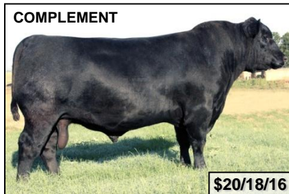
COMPLEMENT FRANCHISE x Midland +13 CED, +117 YW, +.86 Marb, +81.62 $B $20/18/16