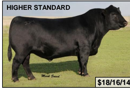
HIGHER STANDARD NEW STANDARD x EXTRA H6 +12 CED, +107 YW, +70.60 $B $18/16/14