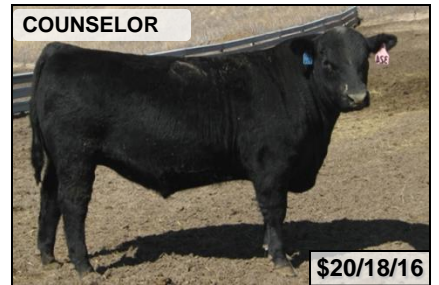
COUNSELOR Connealy Mentor x LEAD ON +10 CED, +115 YW, +.98 REA, +81.13 $B $20/18/16