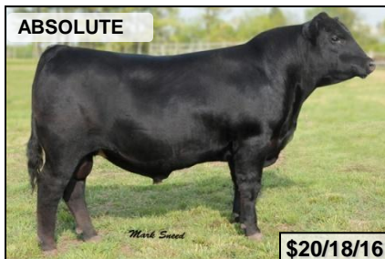
ABSOLUTE Final Answer x Wulffs EXT 6106 +13 CED, -2.8 BW, +117 YW, +64.86 $B $20/18/16