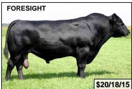
FORESIGHT +106 YW, +1.72 SC, +20 DOC +44.71 $W, +2.54 $EN, +79.12 $B $20/18/15