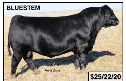
BLUESTEM Net Worth x Future Direction +10 CED, +1.5 BW, +.66 Marb, +73.11 $B $25/22/20