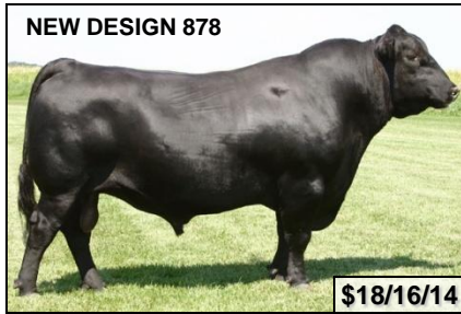
NEW DESIGN 878 The breed's # 1 Pathfinder™ Sire +8 CED & .99 BW acc, Top 5% $W $18/16/14