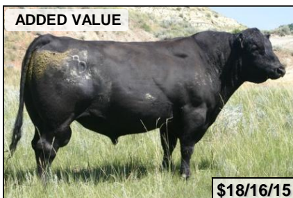
ADDED VALUE Net Present Value x N Bar Honcho -1.6 BW, +52 WW, +.78 SC, +7.74 $EN $18/16/15