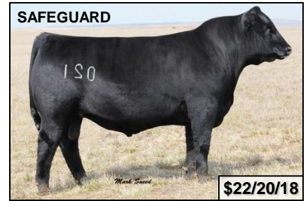
SAFEGUARD New Design 50/50 x FORESIGHT +10 CED, +107 YW, +30 DOC, +82.17 $B $22/20/18