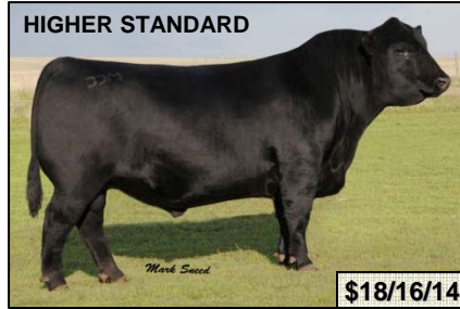
HIGHER STANDARD NEW STANDARD x EXTRA H6 +12 CED, +107 YW, +70.60 $B