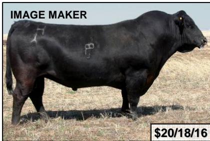
IMAGE MAKER Breed leading maternal value +10 CED, +109 YW, Top 10 $W at +48.88