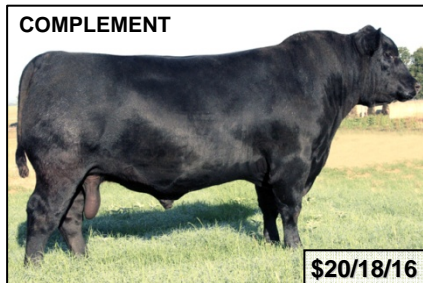
COMPLEMENT FRANCHISE x Midland +13 CED, +117 YW, +.86 Marb, +81.62 $B