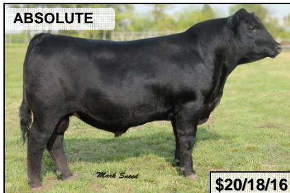
ABSOLUTE Final Answer x Wulffs EXT 6106 +13 CED, -2.8 BW, +117 YW, +64.86 $B