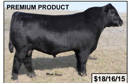
PREMIUM PRODUCT FINAL PRODUCT x Freightliner -0.7 BW, +93 YW, +.81 SC, +.53 REA