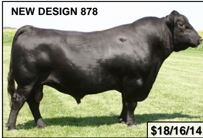
NEW DESIGN 878 The breed's # 1 Pathfinder™ Sire +8 CED & .99 BW acc, Top 5% $W