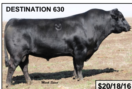
DESTINATION 630 DESTINATION 928 x New Frontier -0.3 BW, +103 YW, +.84 Marb, +83.71 $B