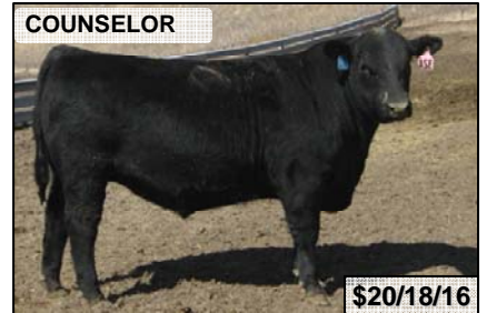
COUNSELOR Connealy Mentor x LEAD ON +10 CED, +115 YW, +.98 REA, +81.13 $B