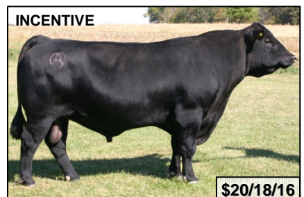
INCENTIVE OBJECTIVE x Bextor +9 CED, +126 YW, +40.90 $W, +84.15 $B