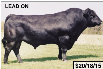
LEAD ON High accuracy maternal genetics +19 DOC, +41.58 $W, +71.72 $B