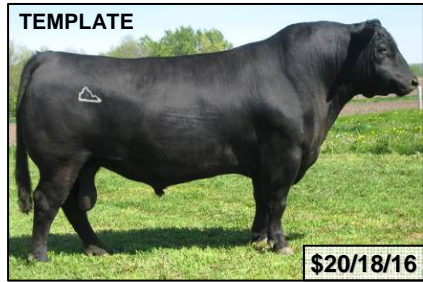
TEMPLATE OBJECTIVE x N BAR PRIME TIME +11 CED, +104 YW, +19 DOC, +.99 Marb