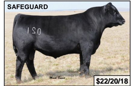
SAFEGUARD New Design 50/50 x FORESIGHT +10 CED, +107 YW, +30 DOC, +82.17 $B