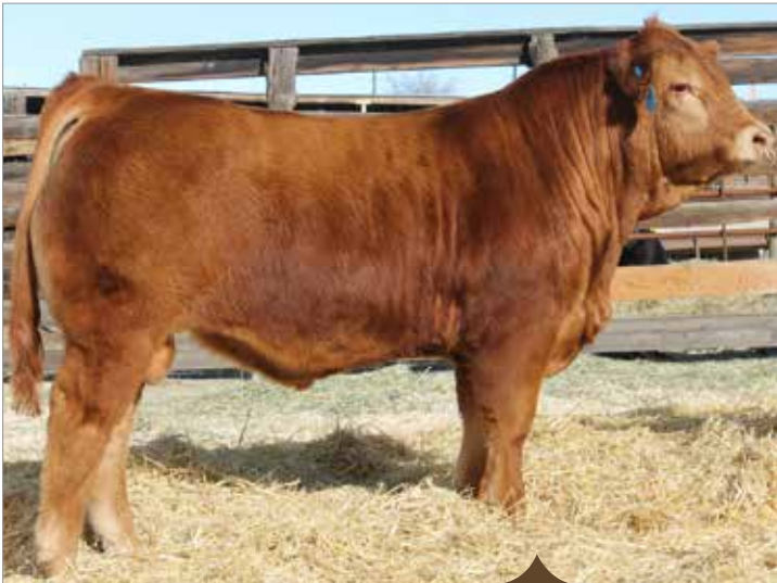
54LM1109 AMAZING BULL WULFS AMAZING BULL T341A (HP*) (PN) (AA)