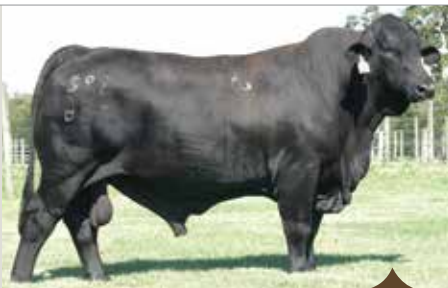
29BN0021 BRAXTON BRAXTON OF BRINKS 392T36 (P)