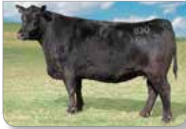
Dam - G A R Progress 830