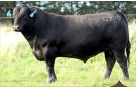
29AN1886 GATSBY MILWILLAH GATSBY G279 (AI) (AMF-NHF-CAF-MAF-DDF-RDF)