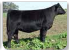
Daughter Maternal brother, Active Duty