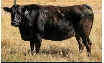
Dam: Peppermill Grove L0021