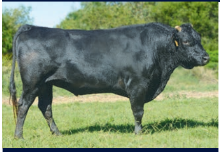
Sire: Mayura Itoshigenami Jnr

Arubial Bond Q007 | 29KB0009 | Owned by: Arubial Wagyus