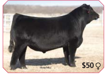
OSU CURRENCY 8173 29AN1749 Easy Money Phenotype