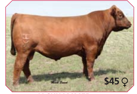
HXC JACKHAMMER 29AR0232 Super Stout Low Birth Weight Prospect