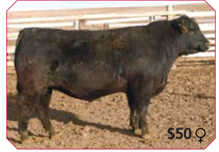
SINCLAIR MULTI-X 29AN1717 Concentrated EXT Genetics