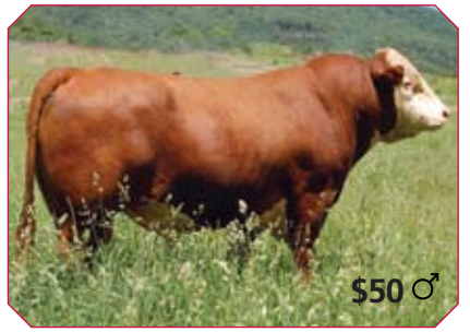
KCF BENNETT 9126J R294 29HP0913 Calving Ease and Carcass Merit