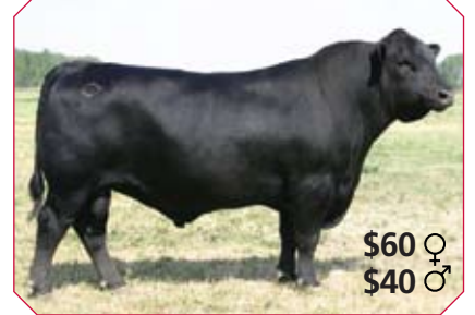
MYTTY IN FOCUS 29AN1640 The Industry's Most Popular Sire