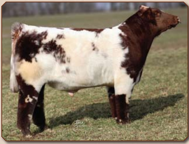
Owned by: Guyer Cattle Company; Lawrence Cattle Co.; Waldock Bros. BORN 1/10/05

ASSET 495501630 CF SOLUTION x K-KIM MONA LISA 35L