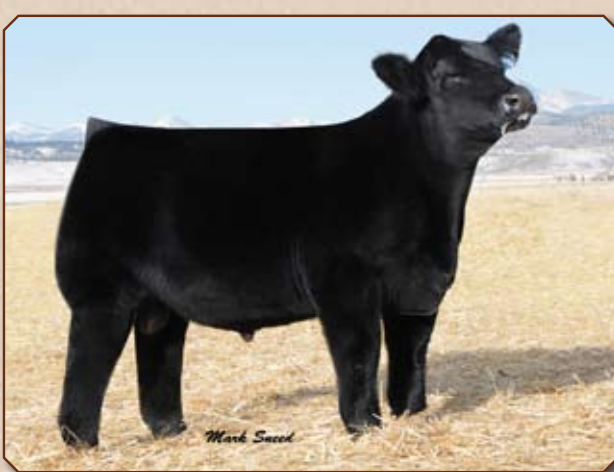
Owned by: Don Putz: Derick Putz BORN 3/12/09