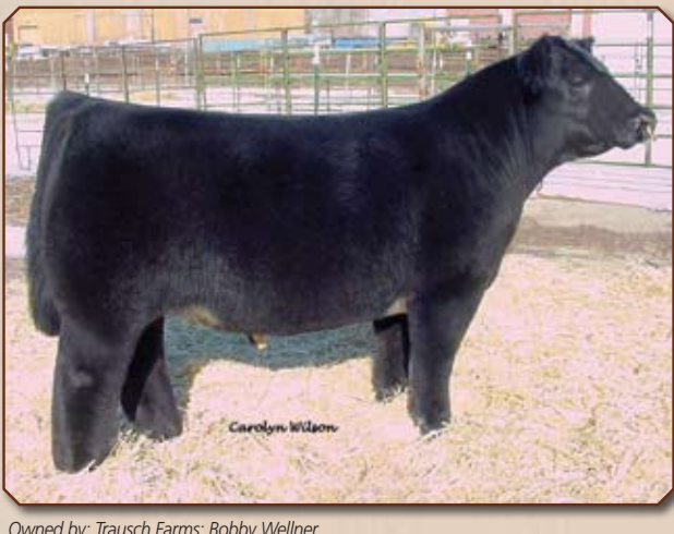
Owned by: Trausch Farms; Bobby Wellner BORN 4/10/07