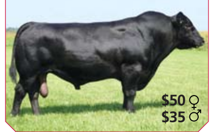
WOODHILL FORESIGHT 29AN1589 Power and Maternal Carcass Sire