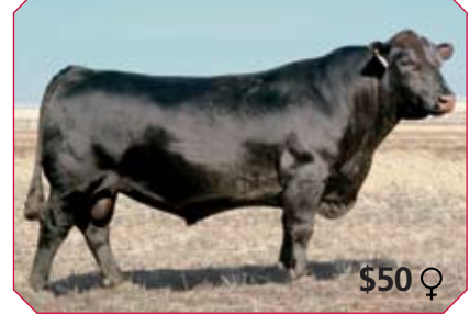
CAR EFFICIENT 534 29AN1704 Outcross Calving Ease – Flawless Design