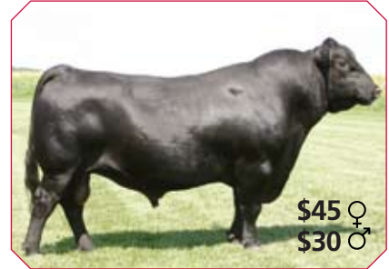
BON VIEW NEW DESIGN 878 29AN1523 The Sure Bet