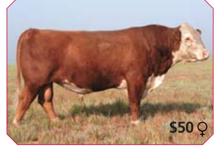
SHF RIB EYE M326 R117 29HP0906 True Pasture to Plate Genetics