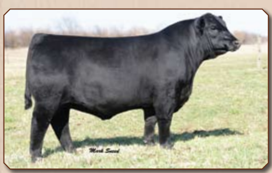
SAV CAST IRON AAA 16115619 TA Owned by: Schaff Ar Limestone LLC, OK; L