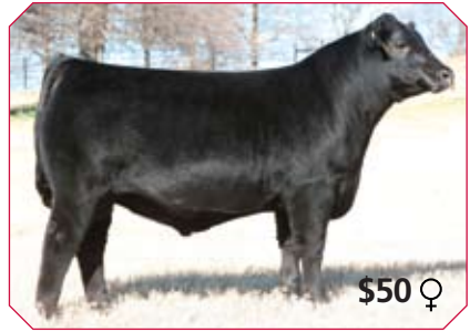
LIMESTONE JUPITER U449 29AN1753 Unique Calving Ease Sire with a Killer Look