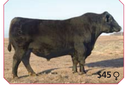
RITO REVENUE 5M2 OF 2536 PRE 29AN1688 Moderation, Muscle and Marbling