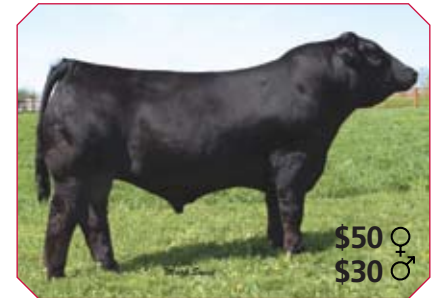
SAND RANCH HAND 29SM0391 The Help You Need