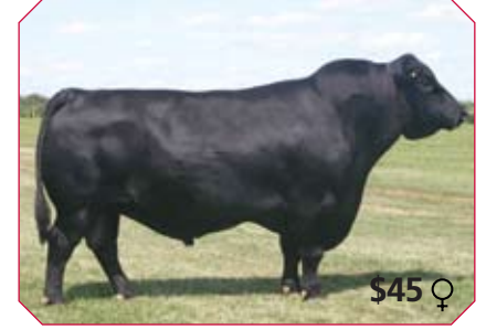
SINCLAIR EXCELLENCY 5X25 29AN1674 Maternal Excellence Pedigree