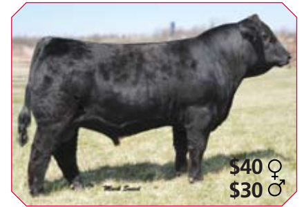
LMF MOVIN FORWARD U3 29SM0415 Power, Performance and Pedigree

*U.S. retail price, call for current availability of these sires and others