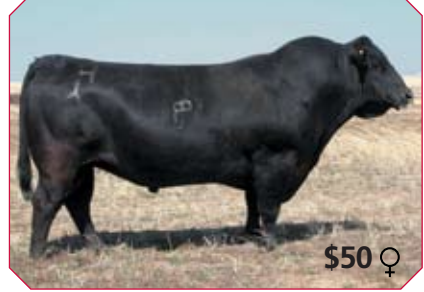
HA IMAGE MAKER 0415 29AN1642 Outcross Maternal and Curve Bender Star