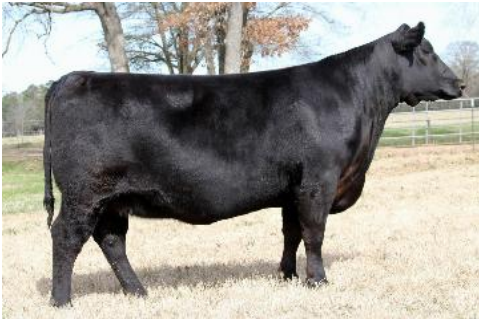
Dam: Dam - G A R Daybreak M721, Owned by: Haley Fairway Farms, TX

BW 205 365 SC Yearling Frame Weight Height Mature Frame