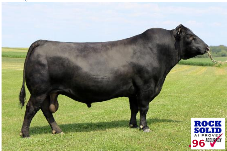
V A R RESERVE 1111 AAA 16916944 Born 01/31/2011 Owned by: Vintage Angus, CA; ABS Global, Inc., WI