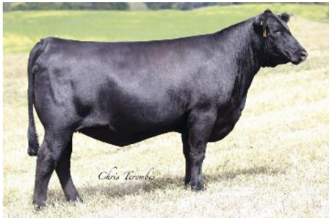
Full_Sister: Full Sister - Quaker Hill Blackcap 3N23, Quaker Hill Farm, VA