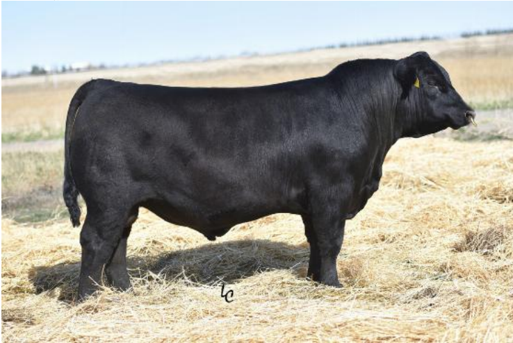
SPRING COVE CROSSBOW AAA 17924903 Born 01/24/2014 Owned by: Spring Cove Ranch, ID; ABS Global, Inc., WI