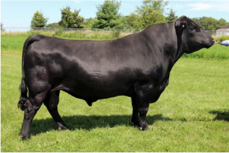
FF HIGHWAYMAN 4W10 AAA 18193706 Born 10/10/2014 Owned by: Friendship Farms, GA; ABS Global, Inc., WI