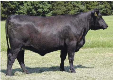
Dtr: Front & Center x Connealy Sullivan 83A, McKellar Executa Roz 4090, Owned By: DFC Dunn Four Ranch LLC, TX

7229, ABSOLUTE, BRUISER, CAPITALIST, FINAL PRODUCT, PAYWEIGHT 1682, PROPHET, RAMPAGE, RESERVE, SAFEGUARD, SPECIAL FOCUS, UPSHOT, WAYLON