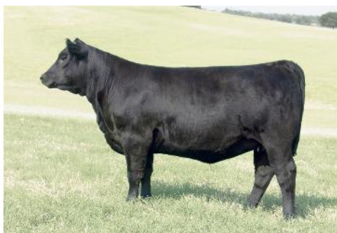
Dtr: RESERVE x ALL AROUND, Cox Miss Lucy 4D79, Cox Ranch, TX

ABSOLUTE, BRILLIANCE, BRUISER, HOOVER DAM, IMPRESSION, INSIGHT, JOURNEY, PROPHET, RAMPAGE, SPECIAL FOCUS, TEN X, TOUR OF DUTY, UPSHOT, WAYLON