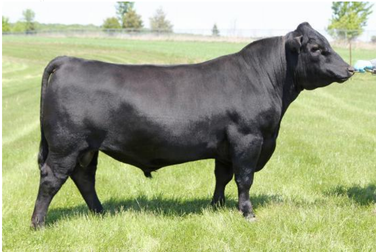
QUAKER HILL CONVICTION 3N30 AAA 17815101 Born 09/12/2013 Owned by: Quaker Hill Farm LLC, VA; Carolton Farms LLC, VA; ABS Global, Inc., WI