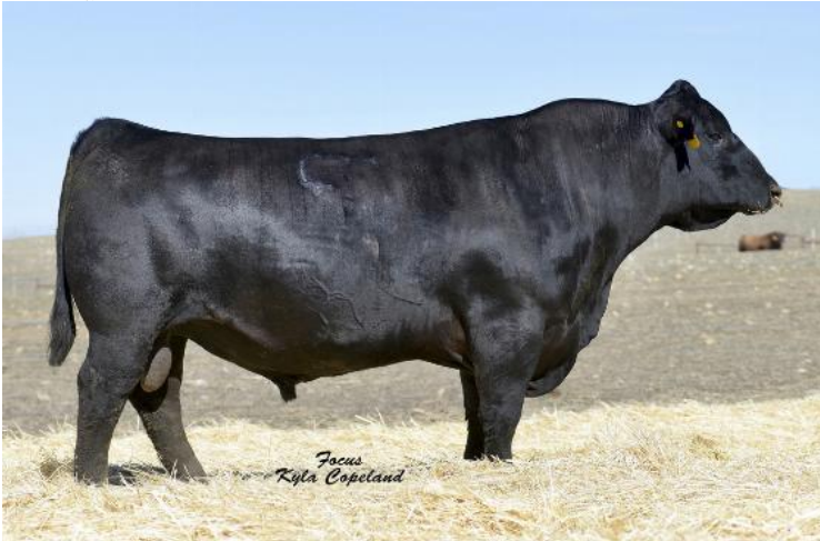
CONNELY FRONT & CENTER AAA 17029809 Born 01/10/2011 Owned by: Galaxy Beef, MO; ABS Global, Inc., WI