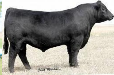
Sire: Connealy Confidence 0100