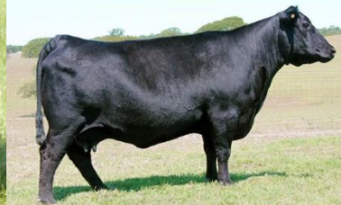
Dam: QHF Blackcap 6E OF4V16 4355