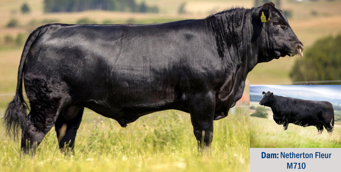
Dam: Netherton Fleur M710

Tag No.: UK 546977 401558 Genus Code: AA1583