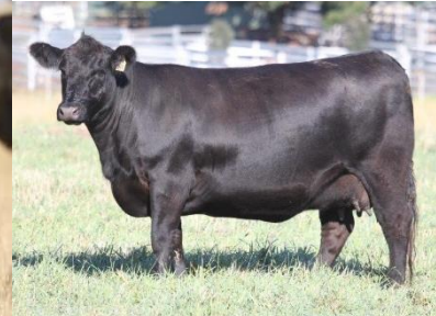
Dam: Millah Murrah Honey H159