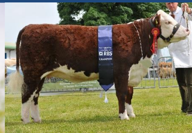
Dam: Frenchstone P.1 Boo