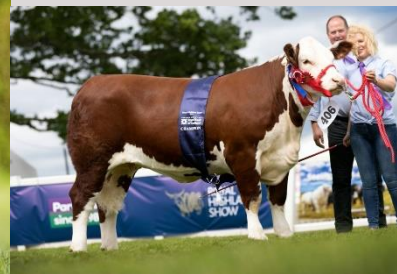
Full sister: Coley 1 Pippa 356

Tag No.: UK 304771 300418 Genus Code: H 9329