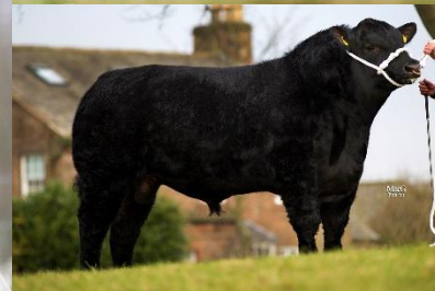
Sire: Gretnahouse Blacksmith L500

Tag No.: UK 561995 401578 Genus Code: AA1501